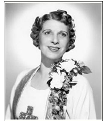
AIMEE SEMPLE McPHERSON

Then she heard another voice: “Now will you go?” She understood it to mean she was to choose between going into eternity or going into ministry. She yielded to ministry. Instantly, she said, the pain was gone, her breathing eased, and she soon regained her strength. Within a decade, the young woman, single mother at the age of 19, would become an American